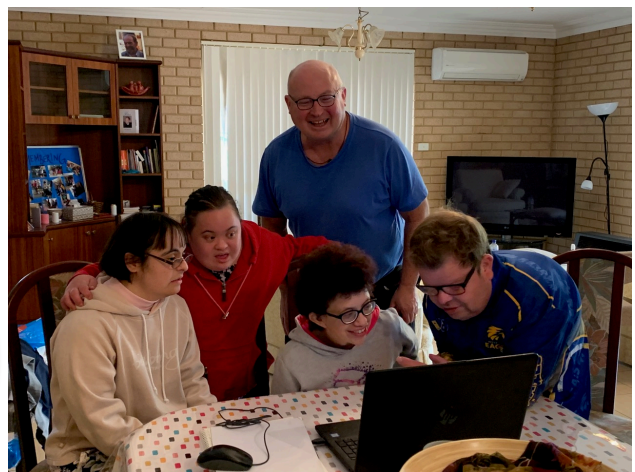
Community Leader and members of L'Arche Perth

Our mission is to make known the gifts of people with intellectual disabilities and in so doing build a more human society