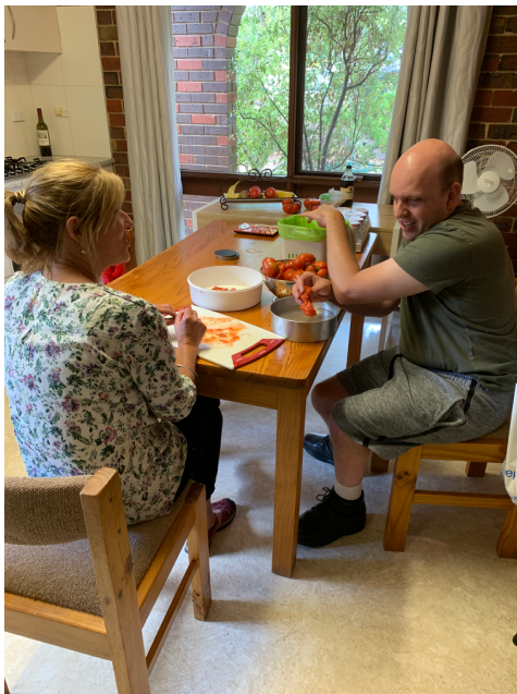
Preparing a meal in L'Arche Bendigo

In Australia there are established L'Arche communities in Hobart, Canberra, Sydney, Brisbane, Melbourne and communities becoming established in Perth, Adelaide and Bendigo with a seed group in Alice Springs