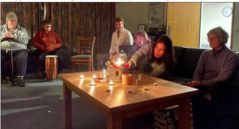
Below: At July's Solidarity we had an opportunity to share what is heavy for us and what gives us hope or joy and then light a candle.