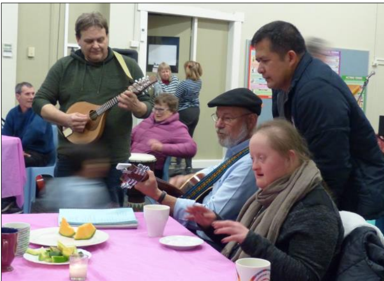
Wandering minstrels, roving around the tables...