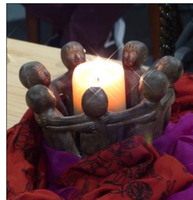
We have a light.