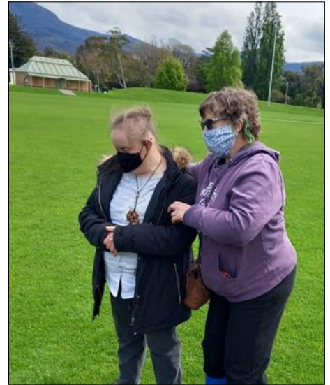
We've been incredibly fortunate in Tasmania not to have had to wear masks very often. A recent situation had us digging them out though.

The recent L'Arche International Festival of Light featured Beni-Abbes singing "I Have a Light" – yes, we went global. Here are some people watching themselves singing on screen, and some screen shots of a few of the people who tuned in from around the globe.