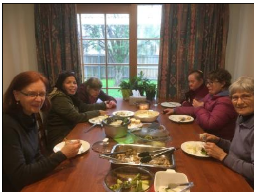
October solidarity – good food, good company, good washer-uppers ...