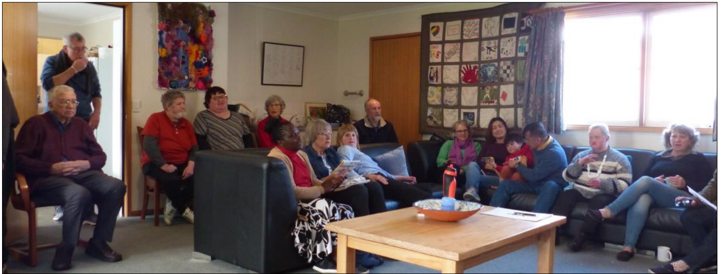
Community gathering 19 September