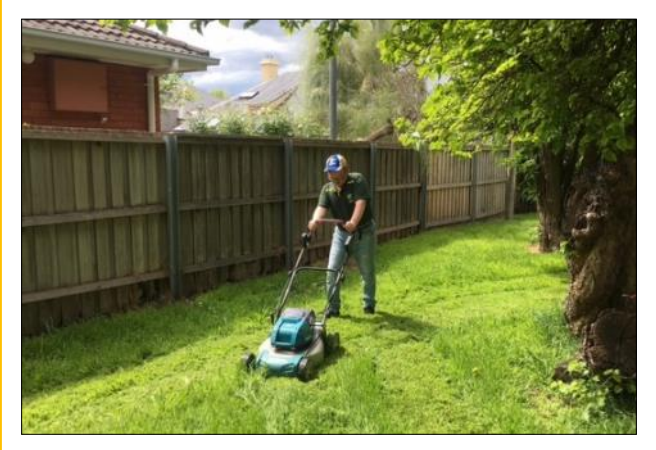
The wet weather has meant the grass has been growing at lightning speed! Here's Garry having a go at taming it.