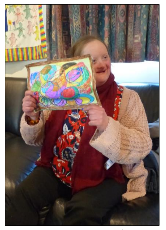
Louise created a lively piece of art.