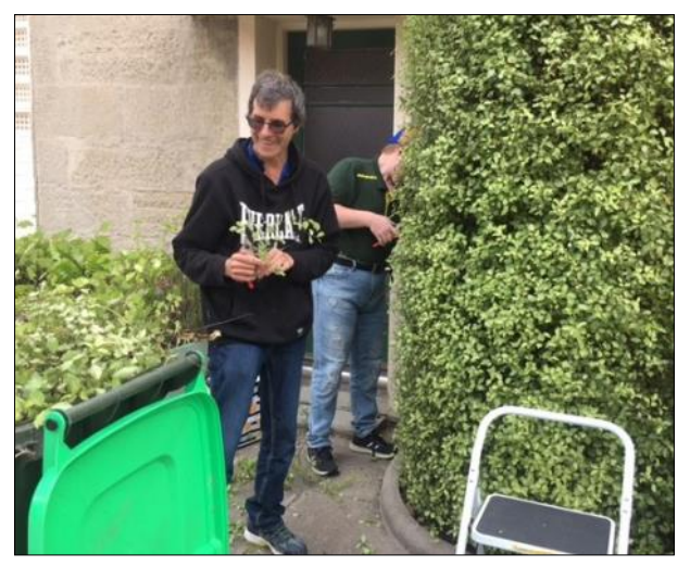
Job done. The green waste bin is overflowing. We're always on the lookout for helpers! See page 9.