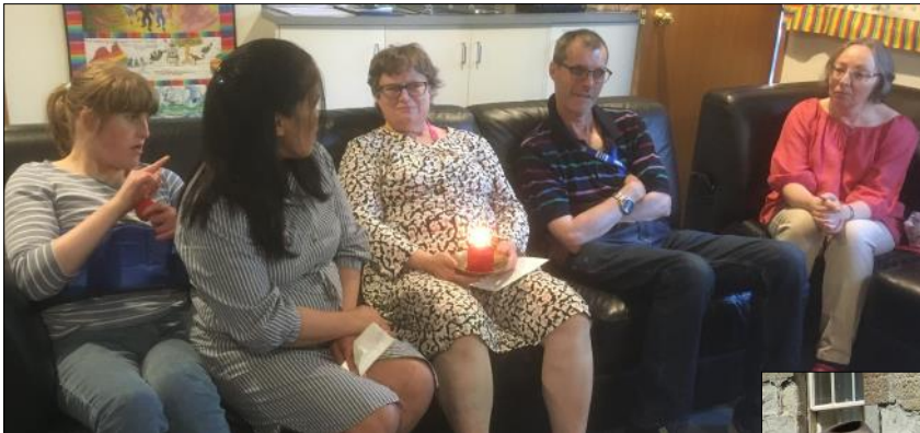
Left: Passing the candle.