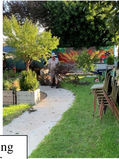
Recent working bee at Grandview