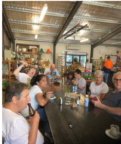
A visit to Peppergreen Farm