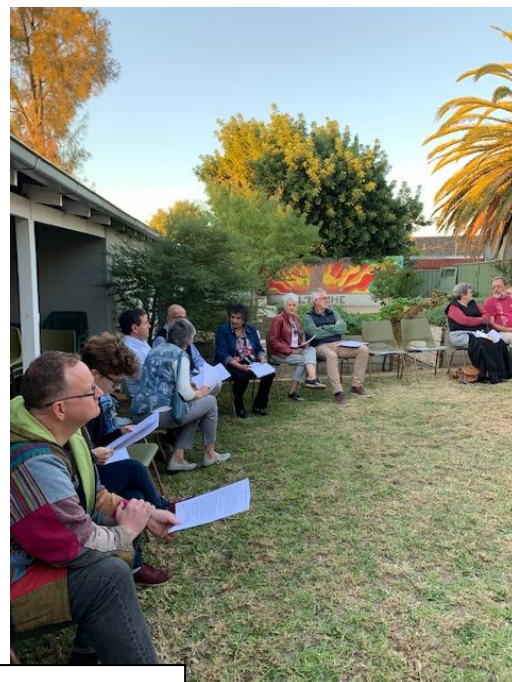
Washing of The Feet Ceremony during Holy Week