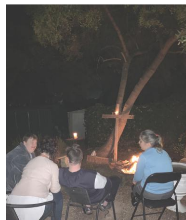
Easter Vigil at Bethany