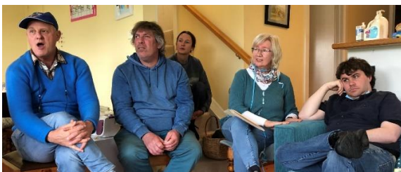
Members of the Melbourne Community