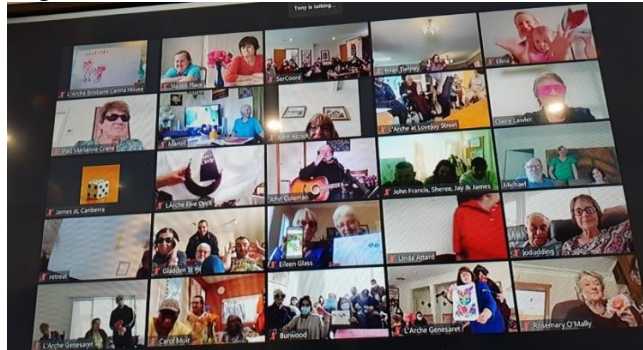
Communities around Australia participated via zoom