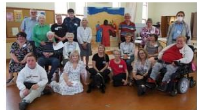
Members from L'Arche Adelaide Community