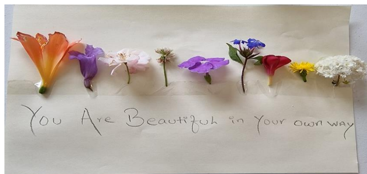
Beautiful in your own way!