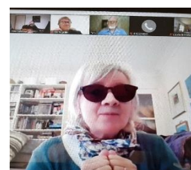
I was blind, now I can see