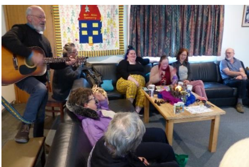
Members of Hobart Community