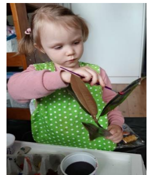
Time to be creative