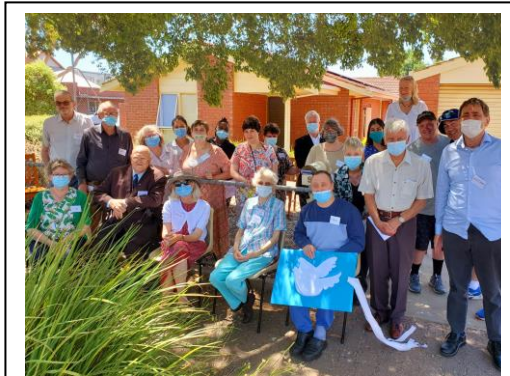
House opening - January 2022