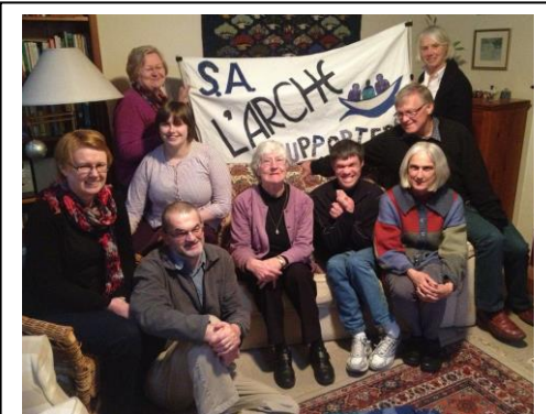
Early Gathering - August 2014

Since our last newsletter we've finally received the great news that our application for NDIS registration has succeeded. We can now put up a shingle on the front door of our house that says, "Open for community living and hospitality."