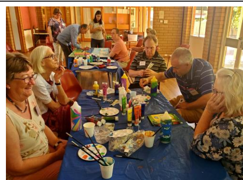
Art workshop – Community Weekend

As I write, I am watching dragonflies helicoptering around the garden in bright sunshine on this beautiful autumn day. As you will have seen, the L'Arche Community calendar of activities is out for 2023. Many fun times have been planned and "everybody and his dog" are invited to come along and enjoy these events. We look forward to another year of fellowship with our friends at St Francis of Assisi too.