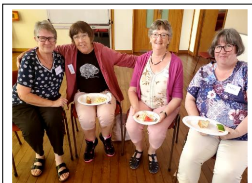
Catch ups - Community Weekend

Here's to a happy 2023 for all our community!