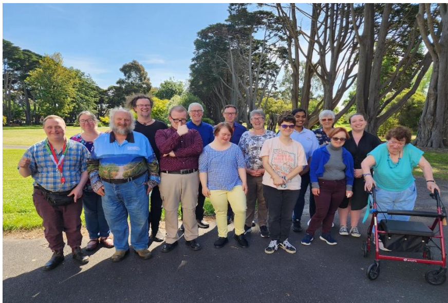
NLSG members and their Companions

Common things we found we liked: work, shopping, traveling, sharing life together.